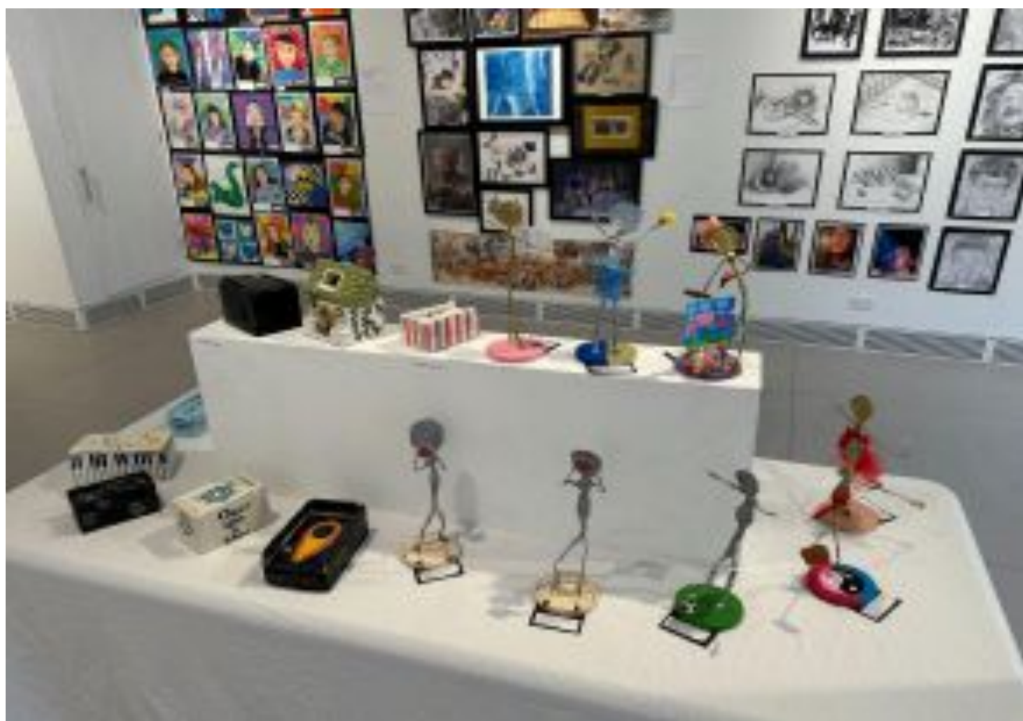
Above: March 14 - 29, 2026: K-12 Student Artwork

SITE: SCHOOL INVITATIONAL THEME EXHIBITION, Rooted: Art in the Natural World featuring the creative artwork of Kindergarten to 12th-grade students in the Hudson Valley region, including students from MHS.